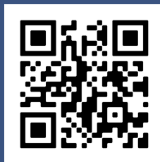
Plain text program